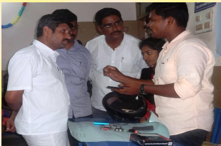
The student explained about his project

Project contest was conducted for the students on 30.08.2017 and 31.08.2017. Nearly 30 projects were displayed and more than 400 students got benefited. The certificate was distributed to the winners during the valedictory function..