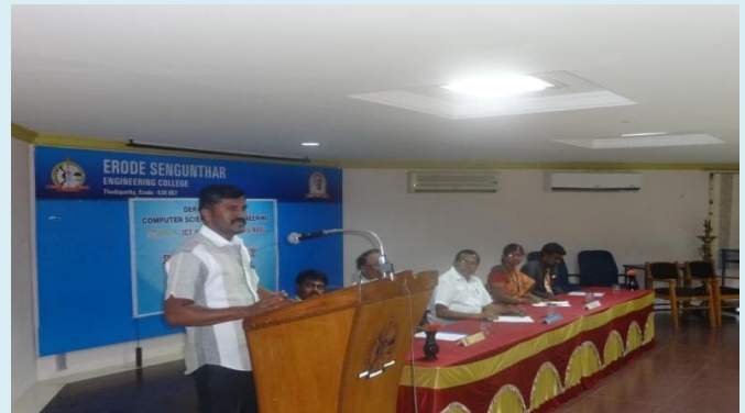
Feedback of a teacher who attended the programme

Digital India pledge 2015 aims to provide literacy for those who have less exposure in digital technologies. In this regard, the Department of Computer Science and Engineering of Erode Sengunthar Engineering College and ICT Academy of Tamilnadu jointly organized the Digital Literacy program for School Teachers from 15.07.2015 to 17.07.15.