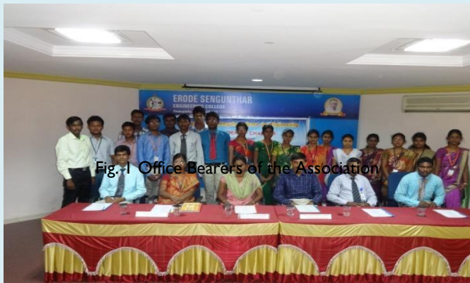
Fig.1 Office Bearers of the Association