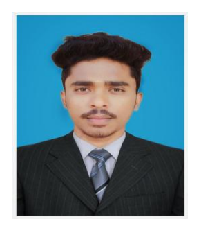
NCR CORPORATION, CHENNAI 1.68 LPA