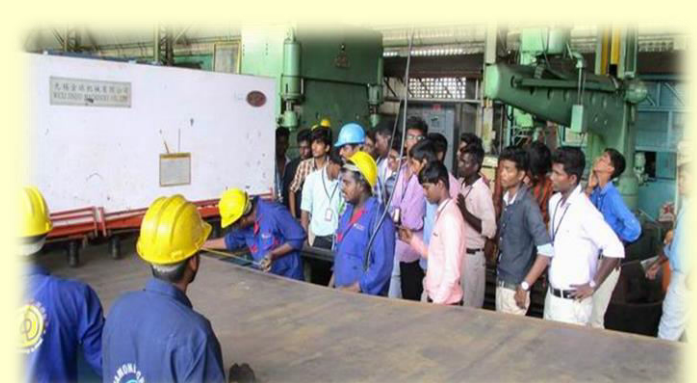
AGNI STEELS PRIVATE LIMITED, ERODE