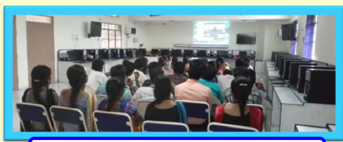
IIT Bombay Remote Center