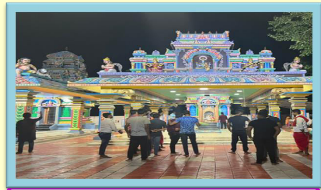
ESEC – TEMPLE