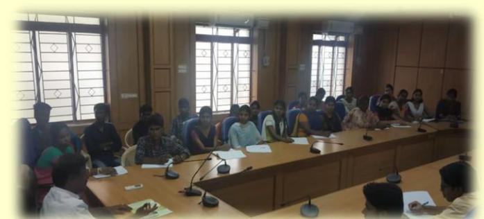
DISTRICT INFORMATION CENTER, ERODE