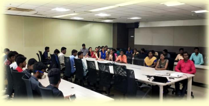
EAAMER LEAD COMPANY PVT. LTD, COIMBATORE