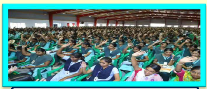
ESEC – IAS ACADEMY