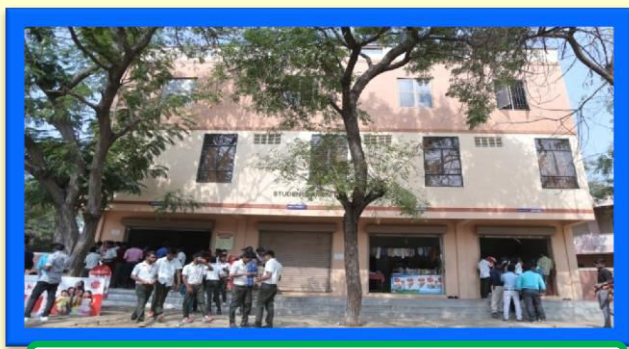
ESEC – AMENITIES CENTER