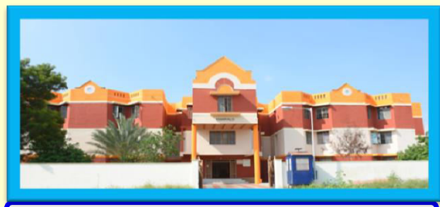
ESEC – HOSTEL