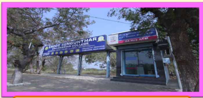
ESEC – ATM CENTER