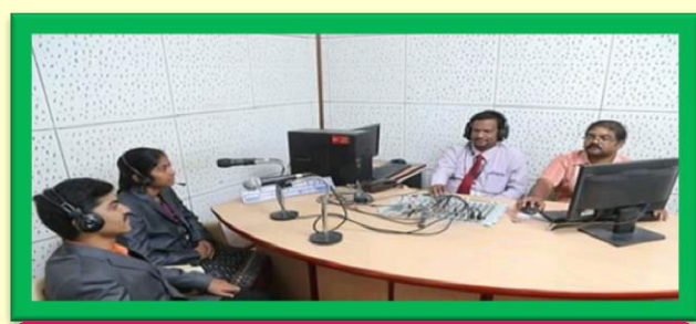
ESEC – MUGIL FM 91.2 MHZ