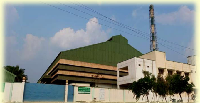
EAAMER LEAD COMPANY PVT. LTD, COIMBATORE