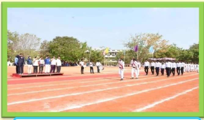
ESEC – PLAY GROUND