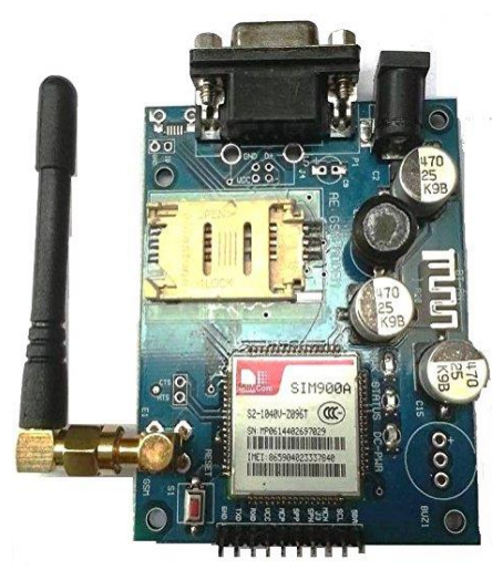
Fig.No.2 - GSM Module