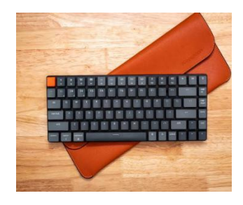
Fig.No.7 - Keyboard

A computer keyboard is a type of peripheral input device modelled after a typewriter keyboard. It utilizes a variety of buttons or keys that function as mechanical levers or electrical switches. Since the 1970s, teleprinter-style keyboards have been the preeminent input method for computers, replacing previous punched card and paper tape technologies. The computer mouse has been a complement since the 1980s.