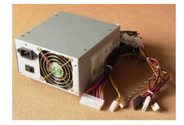
Fig.No.8 - Power Supply Unit