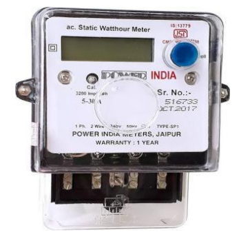
Fig.No.4 - Digital Energy Meter

A device that tracks the amount of electrical energy utilised is called an electric metre, often known as an energy metre. The most used unit of measurement for electricity is the kilowatt hour (kWh), which represents the energy expended by a load that use kilowatt hour for one hour.