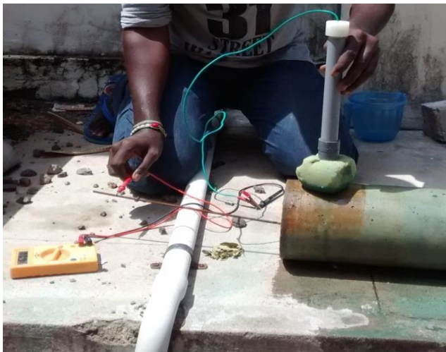
Fig.1 Half – Cell Potentiometer test

In the present study, the corrosion process was accelerated by impressing a constant DC voltage between the steel bar (as anode) and stainless steel plate (as cathode) and the variation of current with time was recorded. The cylinder specimen with a centrally embedded steel bar was partly immersed in a 4% NaCl solution in the beginning stage. After 3 weeks, 5% NaCl solution was prepared and the specimens were immersed. A potential of 12V (DC power supply) was applied across the specimens, the reinforcement steel bar being connected to the positive terminal and stainless steel sheet being connected to the negative terminal of the DC power supply.