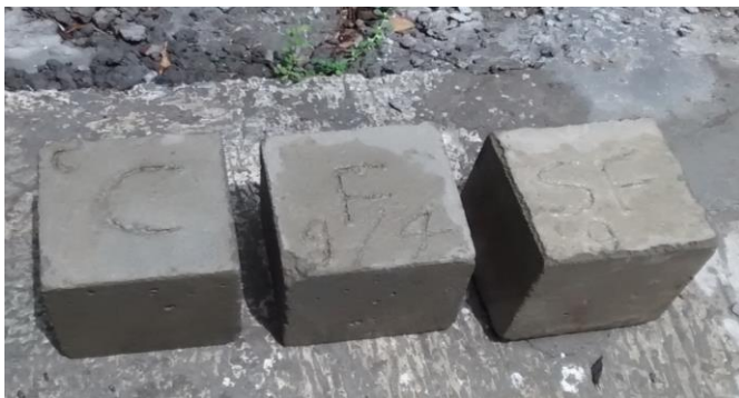
Fig.3 Chloride attack on cubes

A non-porous container is selected and chloride solution has been prepared by adding 5% sodium chloride in distilled water. This solution is stirred well so that all the sodium chloride salts get dissolved in the solution. The initial weights of these cubes are found. Then they are immersed in a chloride solution. After drying the cubes, the change in weight was found and also the compressive strength of concrete cubes was found.