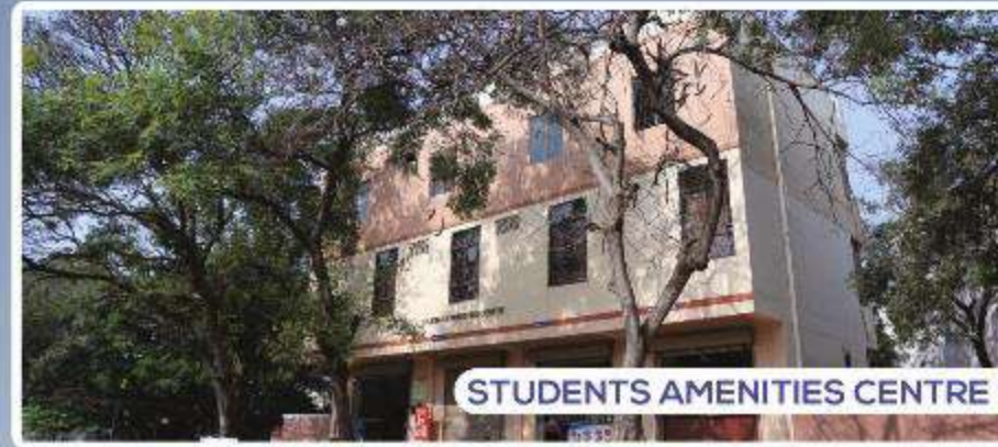
STUDENTS AMENITIES CENTRE