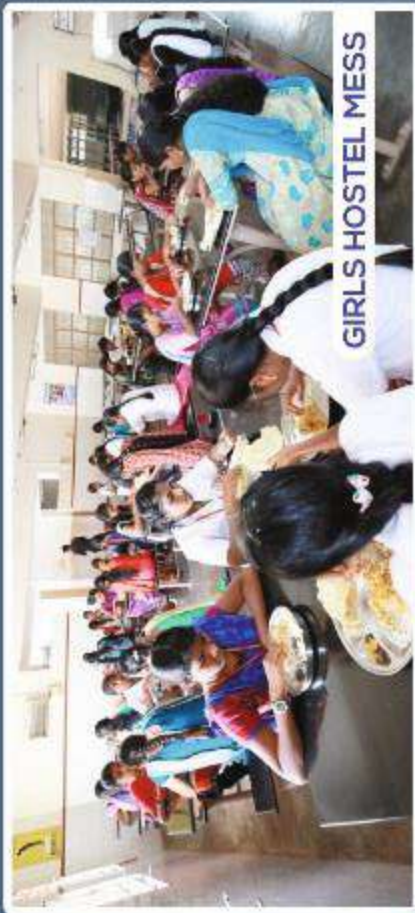
GIRLS HOSTEL MESS