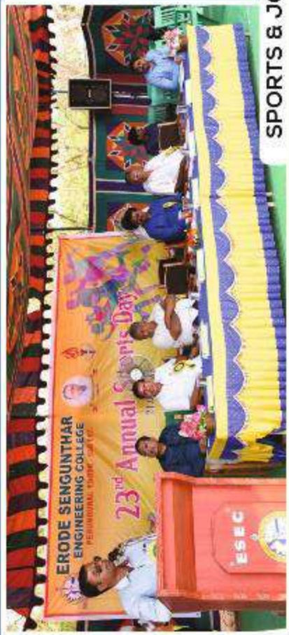
SPORTS & JOB OFFER DAY