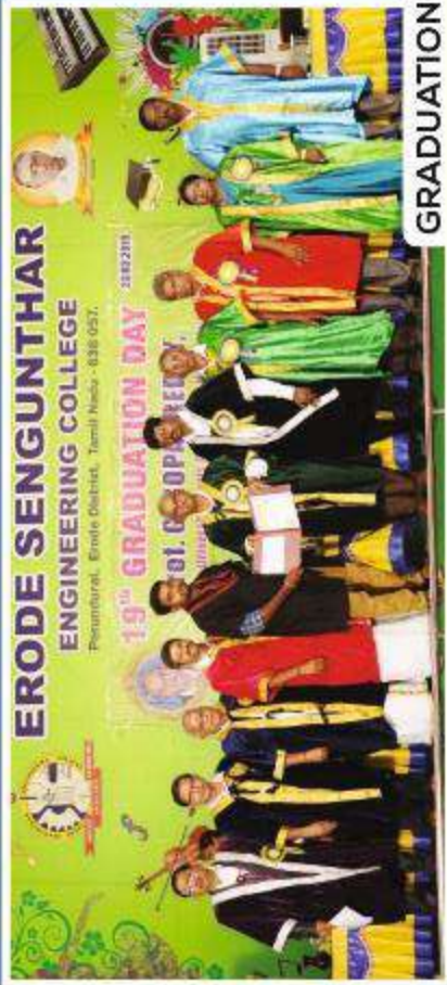
GRADUATION & ANNUAL DAY