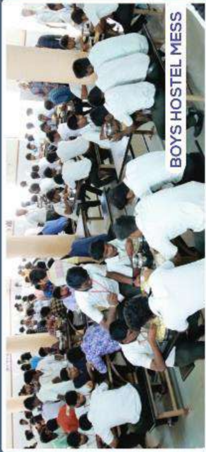
BOYS HOSTEL MESS