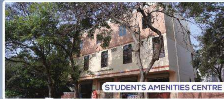
STUDENTS AMENITIES CENTRE