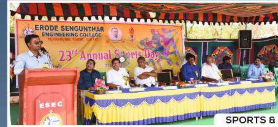
SPORTS & JOB OFFER DAY