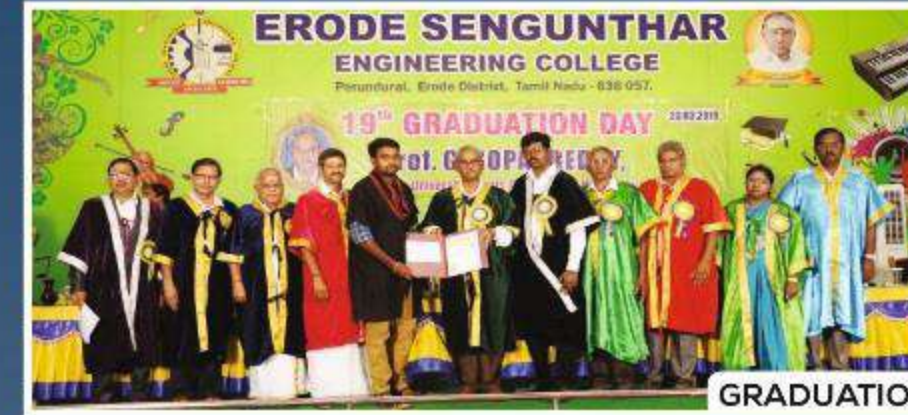
GRADUATION & ANNUAL DAY