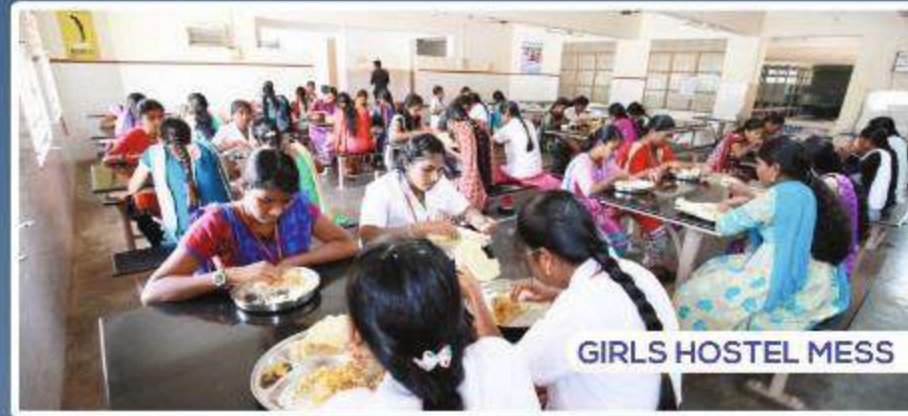
GIRLS HOSTEL MESS