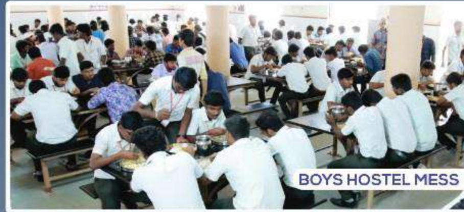
BOYS HOSTEL MESS