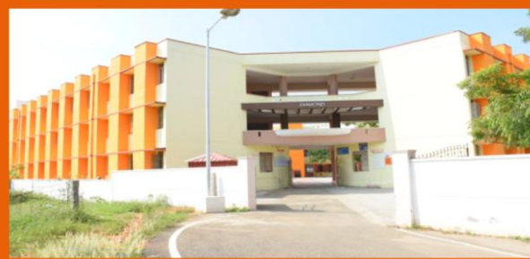
ESEC – HOSTEL