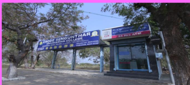
ESEC – ATM CENTER