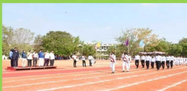
ESEC – PLAY GROUND