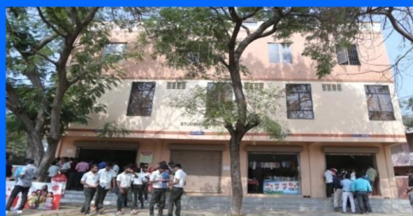
ESEC – AMENITIES CENTER