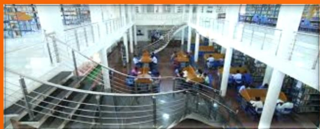
ESEC – IAS ACADEMY