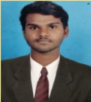
Karthick M Soft Crylic 4.5 LPA