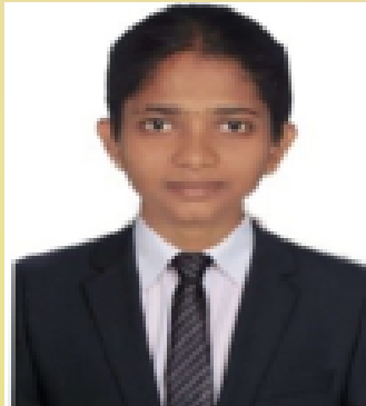
Kokila V Soft Crylic, Ethunus 4.5 LPA, 3.5 LPA