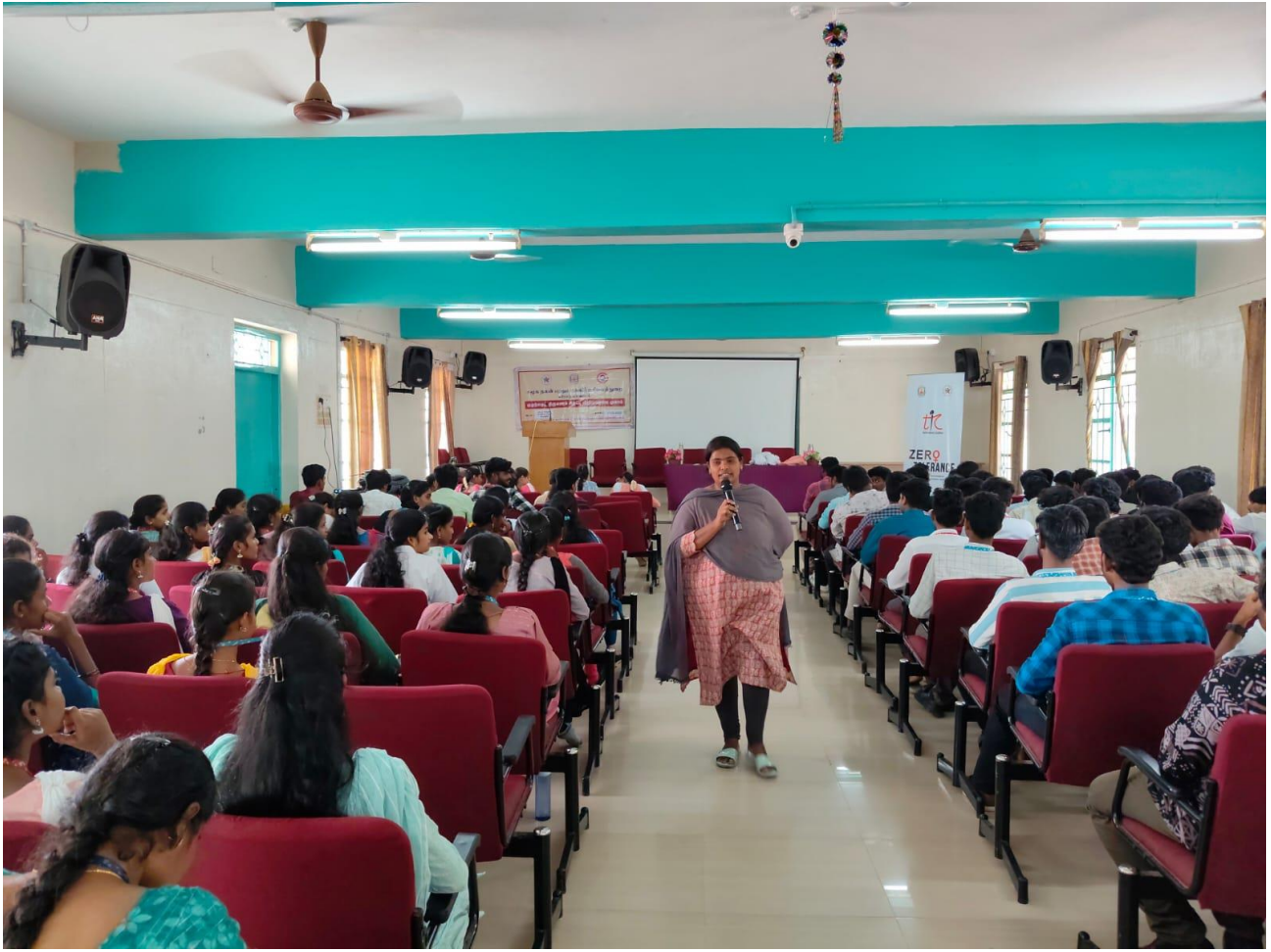
AWARENESS by NGO