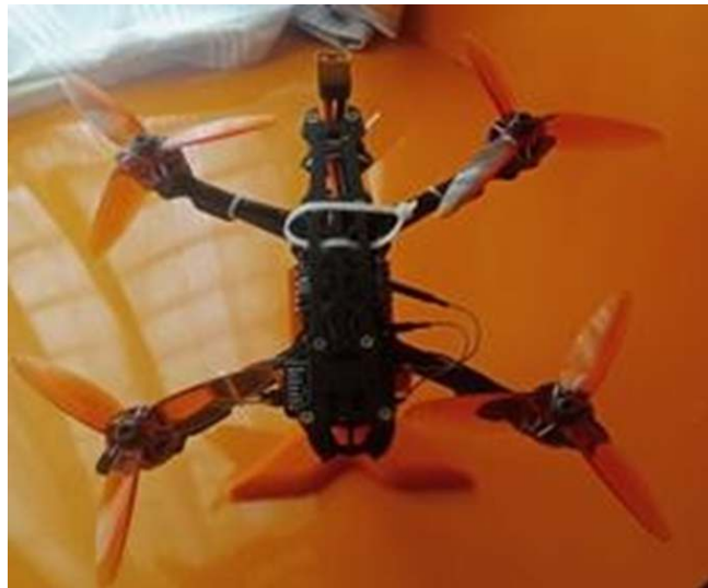
FPV Drone for Surveillance