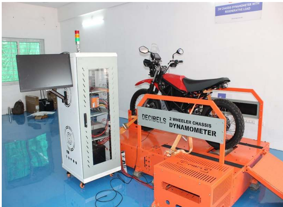
Center of Excellence in Electrical Vehicle Technology