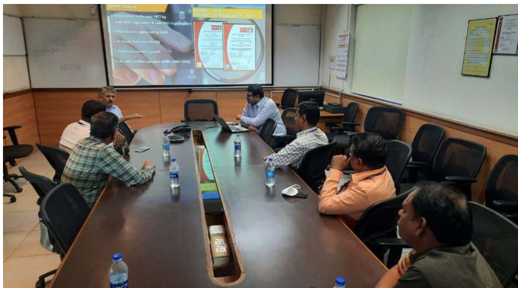
Field Visit on “Field Visit” by Erode Sengunthar Engineering College on 22.11.2024.