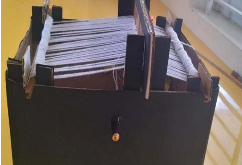
IoT Based Pre-Identification of Thread Based Problems In Traditional Handlooms