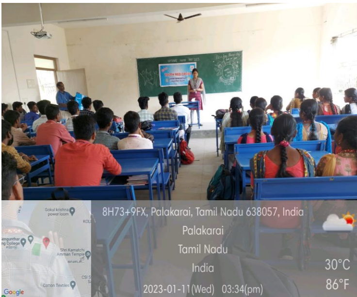
Youth day celebration