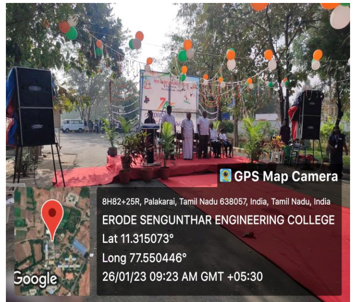
Awareness On Nutrition