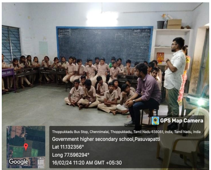
Drugs Awareness Program