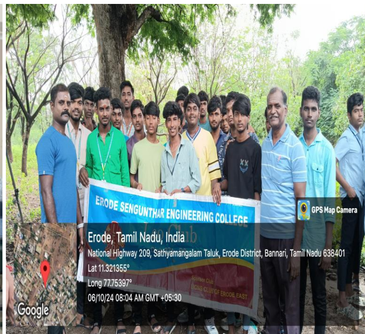
Motivation Program to School Students