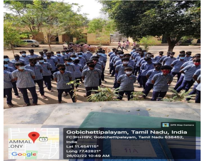
Corona Awareness Camp