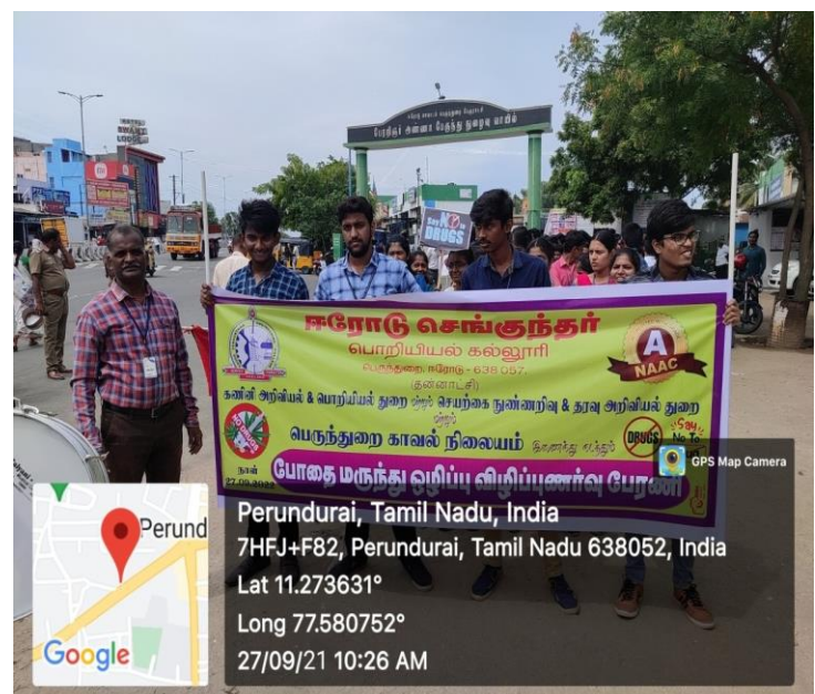
Drugs Awareness Rally